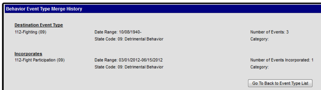
Summary of Merge

A summary of the complete merge displays, showing the destination type and the incorporated (source) type. Click Go Back to Type List to finish. The incorporated (source) type no longer displays in the type list.